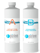
Urinal Trap Acid de-scaler (Part A) & Enzymatic Trap Cleaner (Part B)

* Urinal Designs compatible with both ZeroFlush Liquid Odor Barrier and Pürleve EnviroSeal Trap Systems.