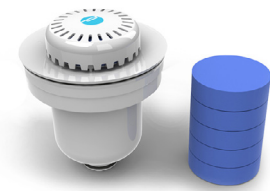
EnviroSeal and BioPür Standard - White/Chrome