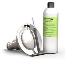
ZeroFlush Liquid Barrier Kit