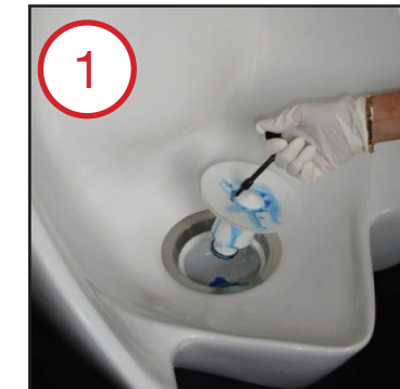
1. Remove the drain insert with the provided tool.

At no time will the person replacing the odor barrier fluid come in contact with urine.