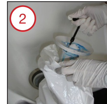
2. Remaining odor barrier and urine in trap will automatically flush away down the waste pipe.