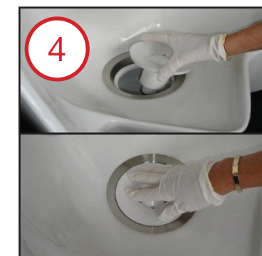
4. Install new drain insert into the housing.