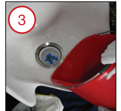
3. Rinse the waste line with a bucket of water.