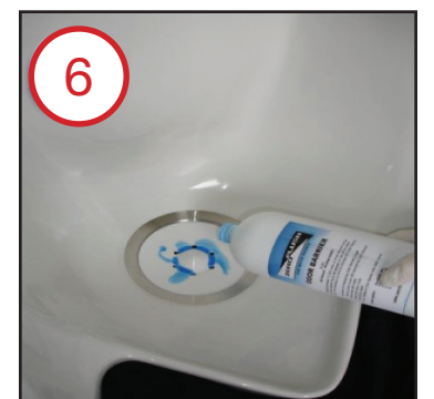
6. Pour 12oz. of proprietary ZeroFlush® Odor Barrier Fluid into the drain insert.