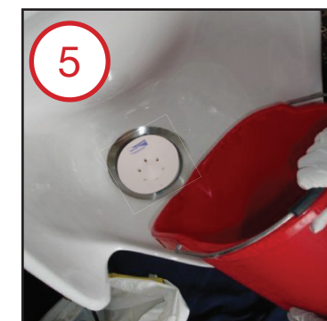
5. Pour in 32oz. of water through the drain insert.