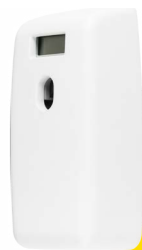
Clean White E101101