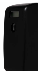
Modern Black E101102