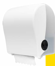
Clean White E301101