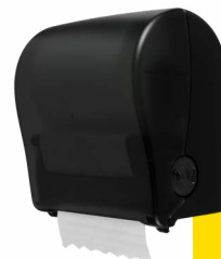
Modern Black E301102