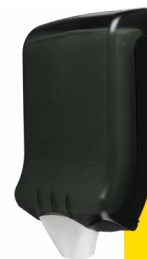
Modern Black E302112