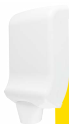
Clean White E302111