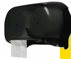
Modern Black E402102