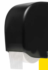
Modern Black E403102