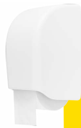
Clean White E403101