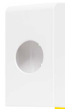
Clean White E603101