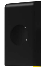
Modern Black E603102