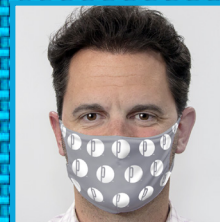
Step & Repeat