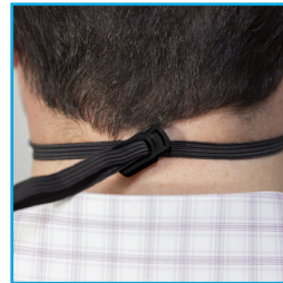
Behind Head Adjustable toggle