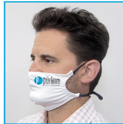
Behind Head Loop