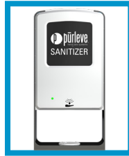
Branding & Refill Identification Placard