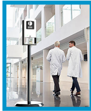
Floor Stand Mount