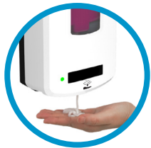
Automatic 'No-Touch' System

The PürClean HYBRID Automatic Liquid Dispensing System is ADA compliant & ensures that the customer has all of their hand care needs in one solution. The proprietary dispenser is first an 'Automatic - No Touch' system; however, it can also be used as a Manual 'Push the Cover' Dispenser to ensure you are never without a 'dose!' The System offers Foam, Liquid & Spray refill options in a 1400 ML container that is 'Refillable' or a 'One Time Use'. The user can choose a small or large dose size for each refill leveraging proprietary dispensing technologies. A placard can be placed behind the Cover Lens for Branding and / or Liquid Identification purposes.