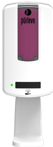
Optional Drip Tray