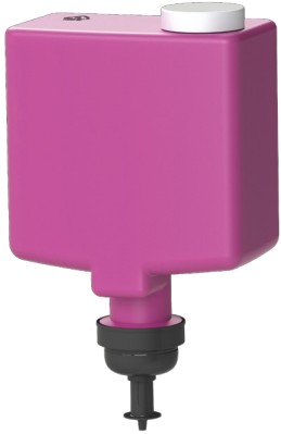
REFILLABLE BOTTLE (1400 ML)

NOTE: Easy to Re-Fill without removing Container from Dispenser