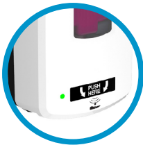
Manual 'PUSH the COVER' System (*'PUSH HERE' warning will illuminate on cover's black decal when batteries LOW)