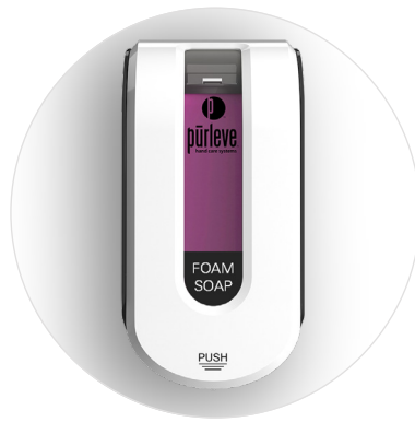
PÜR CLEAN SLIM WALL MOUNT KITCHEN