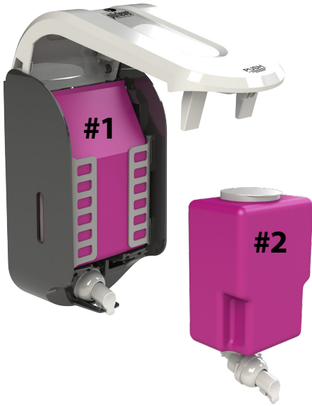
1000 ML Disposable Bag (#1) 500 ML Re-Fillable Bottle (#2) (These refills used for SLIM System ONLY)