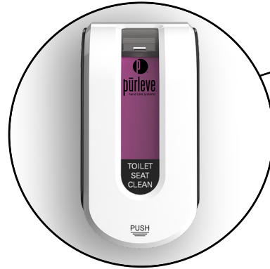
The Placard behind lens clarifies that the dispenser is used for a "TOILET SEAT CLEANING".