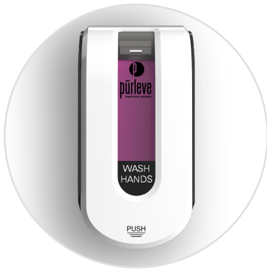
PÜR CLEAN SLIM WALL MOUNT BATHROOM