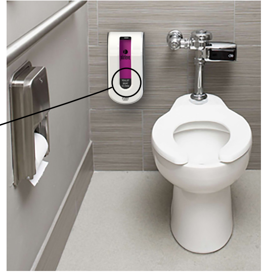
PürClean SLIM is also used as a Toilet Seat Cleaner. Patron sprays sanitizer on toilet paper to clean the toilet seat.