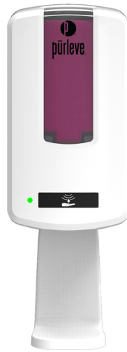
Optional Drip Tray