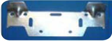
Wall Bracket for ZF-101

Before installing the urinal, make sure drain line is clean and clear of debris