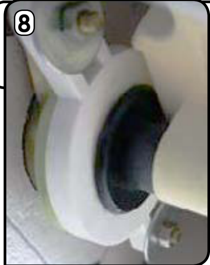
8 Drain pipe should go in until it meets the stop inside the trap housing

BEFORE REPLACEMENT URINAL INSTALLATION PLEASE: • Shut off and cap water supply. • Remove existing hardware, caulk and grout. • Remove all hidden traps and conventional siphons. • SNAKE the sewer line thoroughly • Check for PROPER VENTING • ENSURE PROPER DRAIN PITCH to ensure water flows from the Urinal.