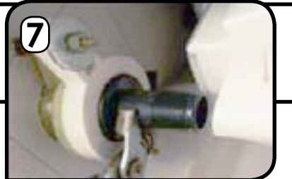
7 PULL drain forward with channel lock pliers into housing drain until it meets internal stop

NEW CONSTRUCTION Drain Must Have Standard Urinal Flange NOT SUPPLIED.