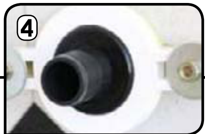
4 Insert drain tube through coupler front side. Install coupler on flange