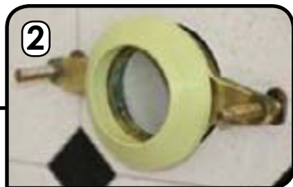
2 Place rubber gasket