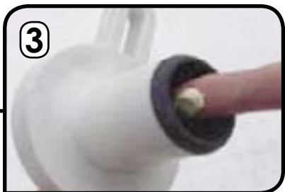
3 Lubricate coupler male side