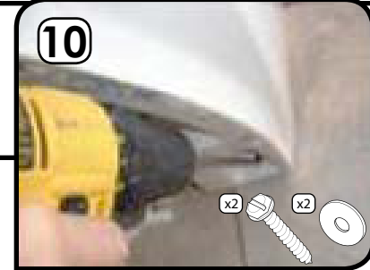
10 Using the 2 rubber washers and two 1.5in (38.1mm) screws, continue to anchor the bottom of urinal to the wall.