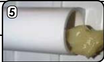
5 Lubricate Housing drain