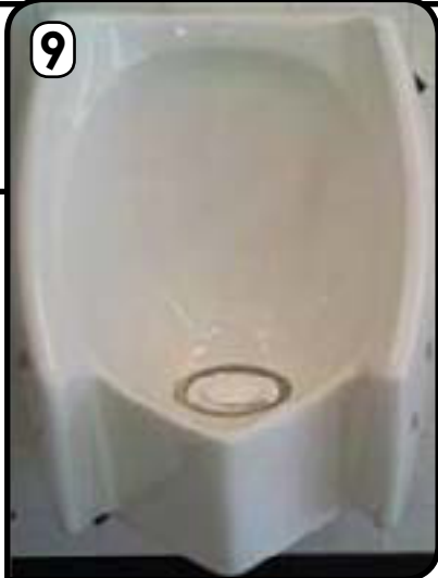
9 Remove Insert and run water through system. Check for leaks