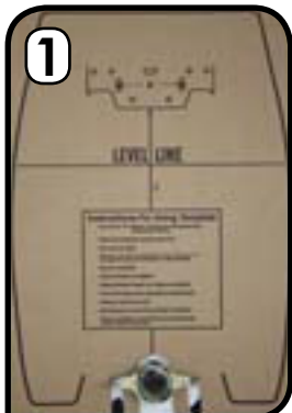
1 Place Template Over Drain - 101 template shown