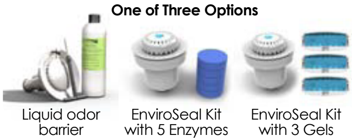
One of Three Options