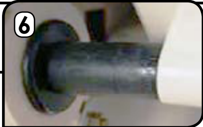
6 With urinal on wall. Test Fit proper alignment