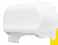
Clean White E401101