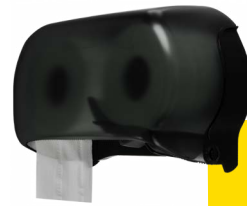
Modern Black E401102